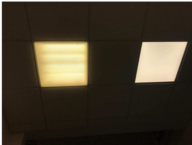
Before (LHS) and After (RHS) New LED Panels