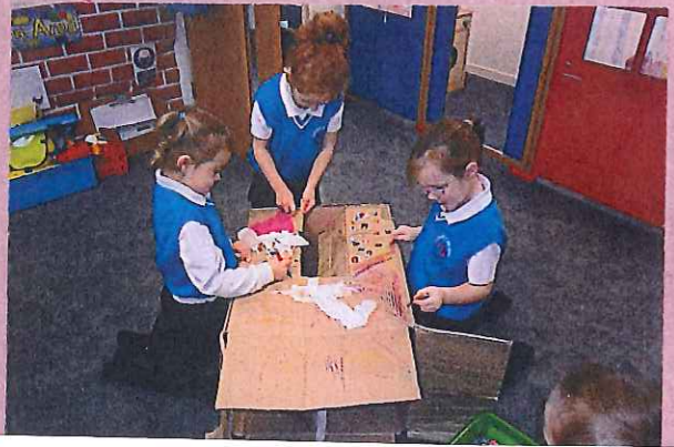
Selected from a range of resources - making and then decorating a house with friends